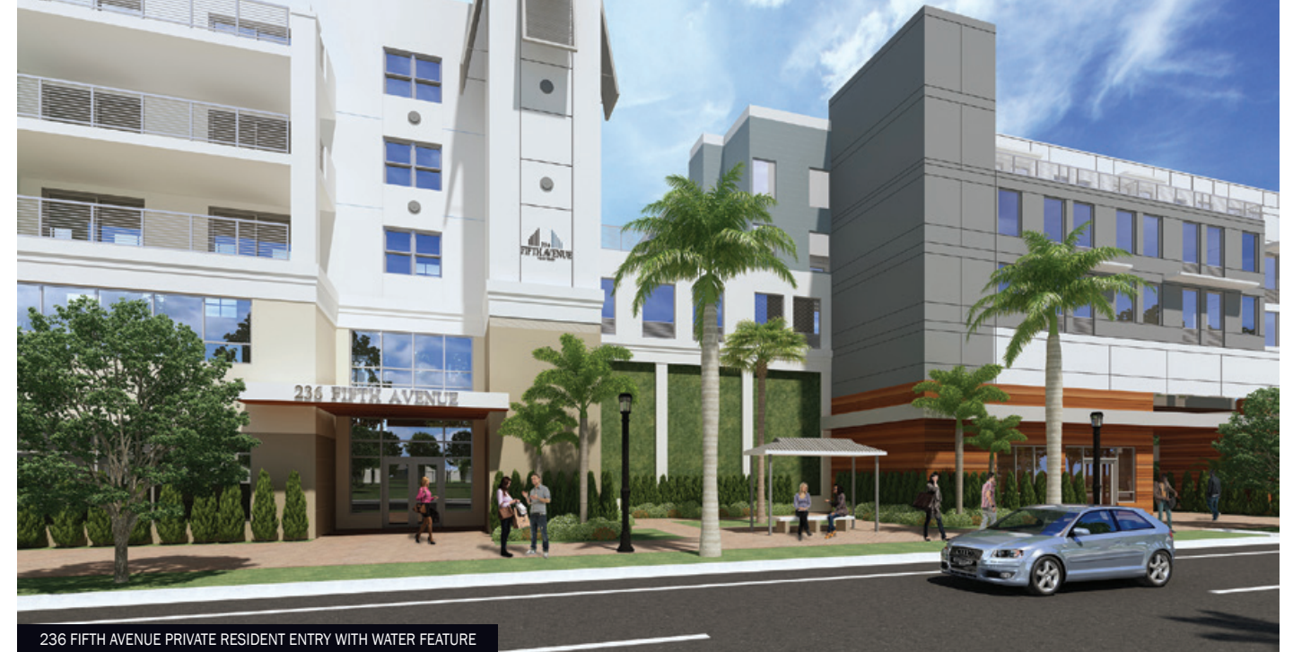
236 FIFTH AVENUE PRIVATE RESIDENT ENTRY WITH WATER FEATURE