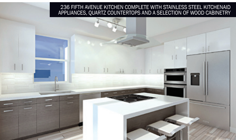
236 FIFTH AVENUE KITCHEN COMPLETE WITH STAINLESS STEEL KITCHENAID APPLIANCES, QUARTZ COUNTERTOPS AND A SELECTION OF WOOD CABINETRY

236 FIFTH AVENUE 236 SE 5th Ave Delray Beach, FL 33484 (561) 704-5559 www.236fifth.com