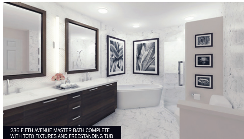
236 FIFTH AVENUE MASTER BATH COMPLETE WITH TOTO FIXTURES AND FREESTANDING TUB