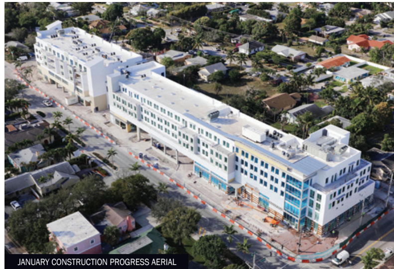
JANUARY CONSTRUCTION PROGRESS AERIAL

The new residence is part of the hotel project, Aloft Delray Beach, and shares the many amenities including the state-of-the-art fitness center, relaxing Infinity-edge pool with poolside towel